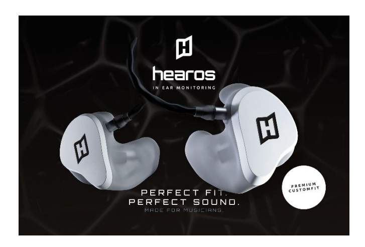
Photo 2 Caption: hearos unifit – Universally suitable in ear monitors with a precise sound image, developed for musicians who make no compromises on and behind the stage.